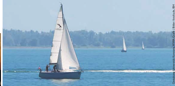
Gestaltung: Universität Konstanz, WWA, Grafik